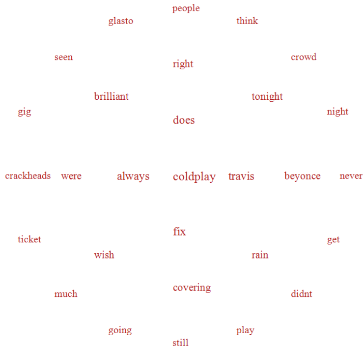
Figure 3: Word cloud showing words in context with ‘Coldplay’ and also in context with ‘Travis’ from tweets made on the Saturday

‘rain’. This is not so surprising, given that festivals are renowned for their poor weather. But is this word coming up as a reference to the weather? And why particularly for Coldplay? In addition, why is Travis coming up in context at all?